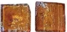
TIGER EYE F169.05