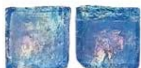
AQUA BLUE F169.05