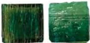
KELLY GREEN F173.70