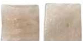
BURLEY WOOD F173.70