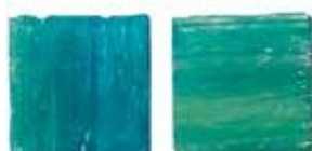
SOUTH BEACH F173.70