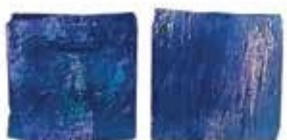
NAVY BLUE F173.70