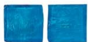
HAWAIIAN BLUE F169.05