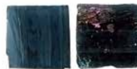
STORM BLUE F173.70