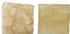
BUTTER SCOTCH F173.70