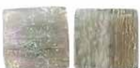
SILVER MOON F173.70