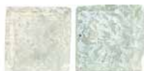
ASPEN GREEN F169.05