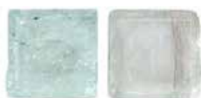
CAYMAN BLUE F169.05